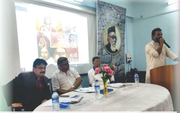
National Workshop on "Translation: A bridge between ancient heritage and contemporary youth" -27<sup>th</sup> February, 2020.