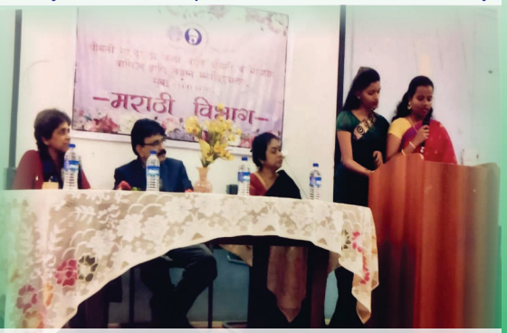
8th August '19 Gandh Pavsacha Poetry recitation 30 students' participated