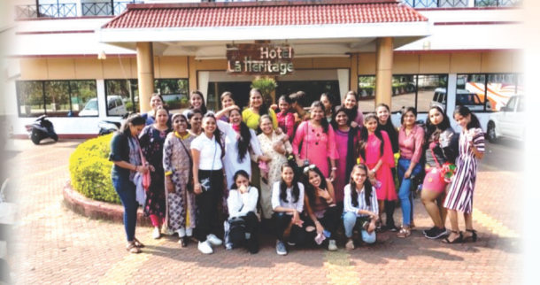
teconomics students visited Bombay Rayan & Nipra Packaging Pvt. Ltd. grued 73 dependent of the Silvassa industrial area on 10° and 11° December 2019